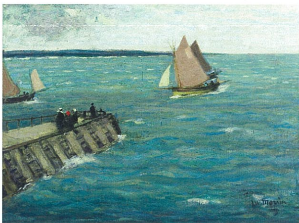
SAILING BOATS , oil on canvas Auction Estimate: $250,000 - 300,000