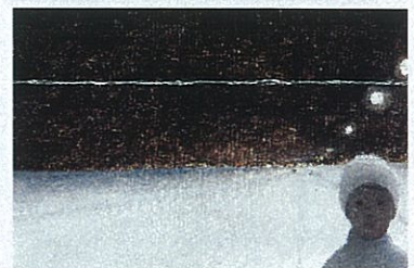
$287,500 JEAN-PAUL LEMIEUX, REVERBERES A RECORD FOR THE ARTIST