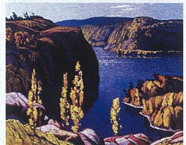
$489,000 A.J. CASSON, OCTOBER MORNING A RECORD FOR THE ARTIST